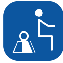
Max user weight ▼

More information about this product, including the user manual, please visit our website: www.dhcare.com