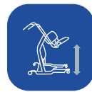
Seat height ▼