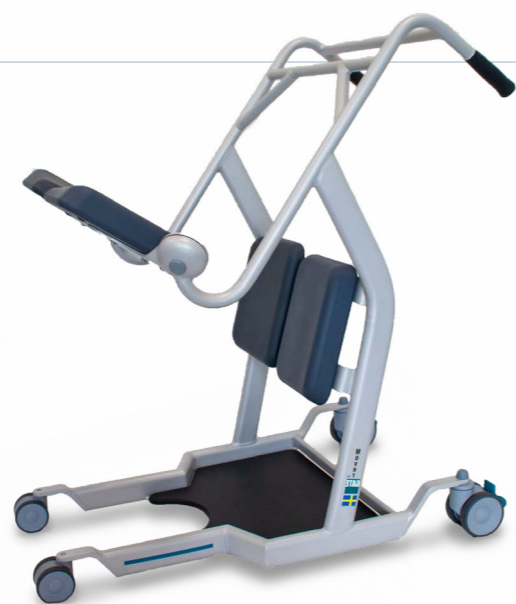
> Mover Aqua