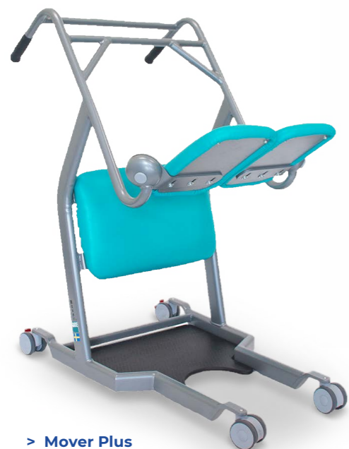
> Mover Plus

Choose Mover Plus for daily indoor transfers in care settings and at home. Choose Mover Aqua when transfers happen in bathrooms, showers or other wet environments where hygiene matters most.