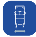
Width - external ▼